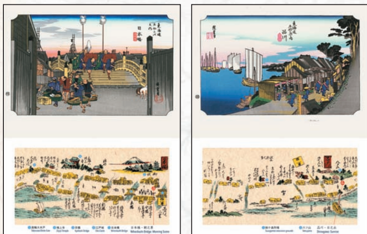
Ukiyoe & old map panel (Digital Art Print)

Supported by Toppan Forms Co., Ltd., Kochizu Library Co., Ltd., Takahashi Studio Inc.